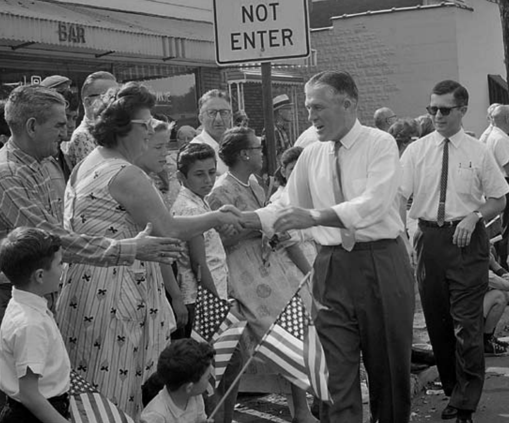
Romney greets the crowd at the Michigan State Fair during the 1962 gubernatorial campaign.