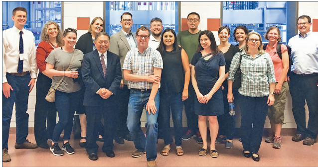
Conference attendees at WCND

The Romney Institute of Public Management solidified its name in the nonprofit data game when it teamed up with the BYU Department of Sociology to cosponsor the West Coast Nonprofit Data Conference (WCND) this spring. This was the first time BYU has hosted the conference since it started in 2004.