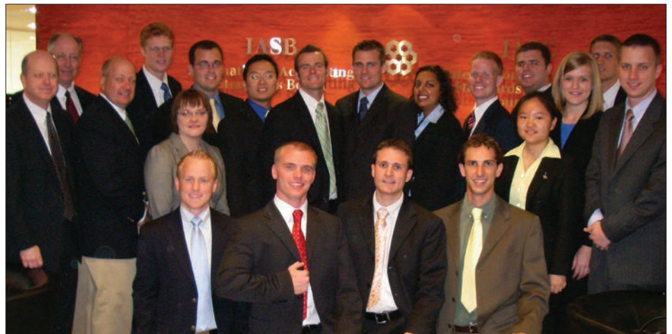
Accounting study abroad participants visiting the International Accounting Standards Board in London.