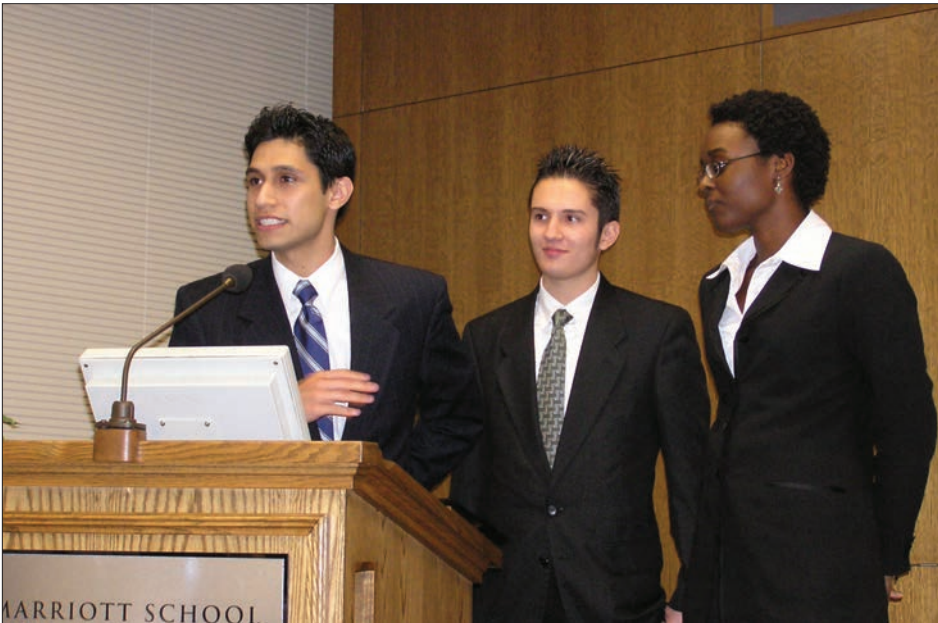
University of Pennsylvania team members present their case in the final round.