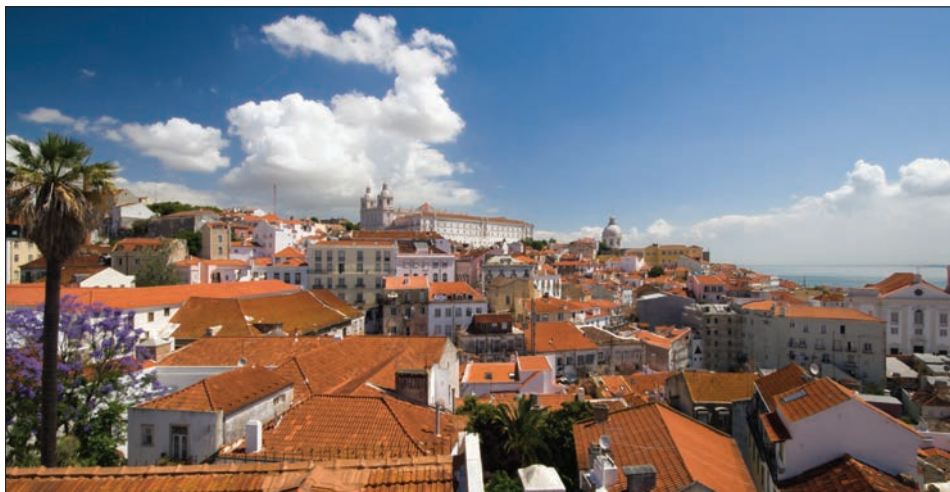
Rooftop view from Santa Justa Tower in Lisbon, Portugal.