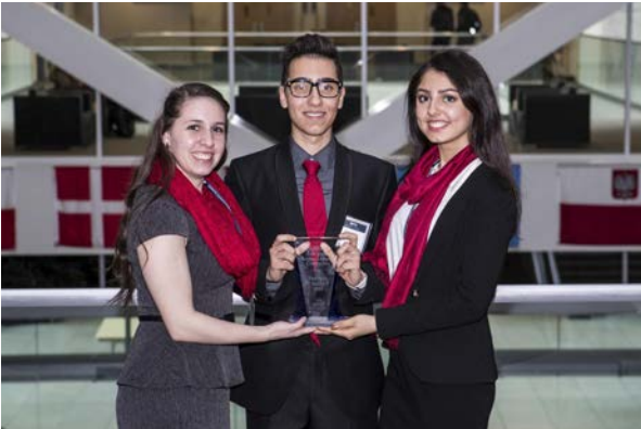
Skyline High School students pose with their trophy after they placed first in the High School Business Language Competition.

"Why not plant that seed earlier into the minds of high school students locally?" Wood says. "Some of these students may come to BYU and some may not. Either way, we're helping students see the possibilities of using multiple languages in business."