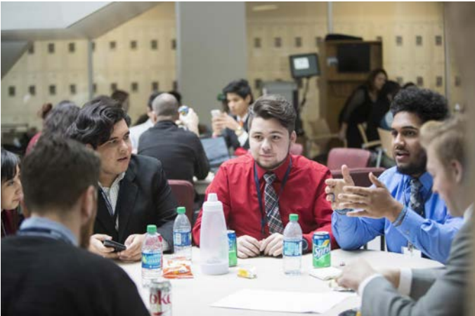
High school students eat lunch and chat together at the High School Business Language Competition.